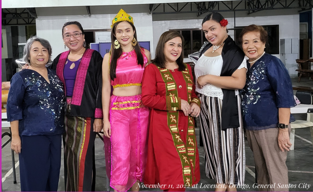
November 11, 2022 at Lovenes, Oringo, General Santos City