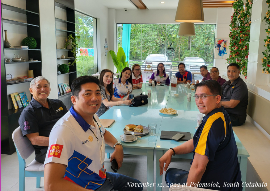
November 12, 2022 at Polomolok, South Cotabato